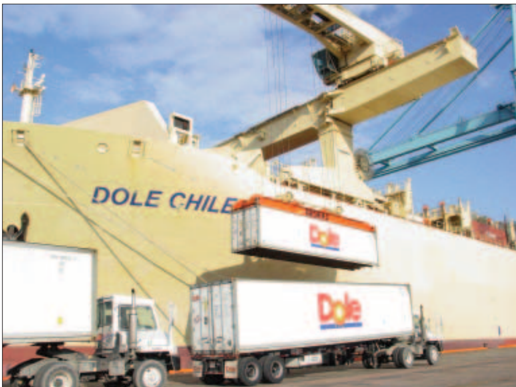
Weekly reefer container lines to the Port of Wilmington provide excellent export opportunities for destinations in Central America.