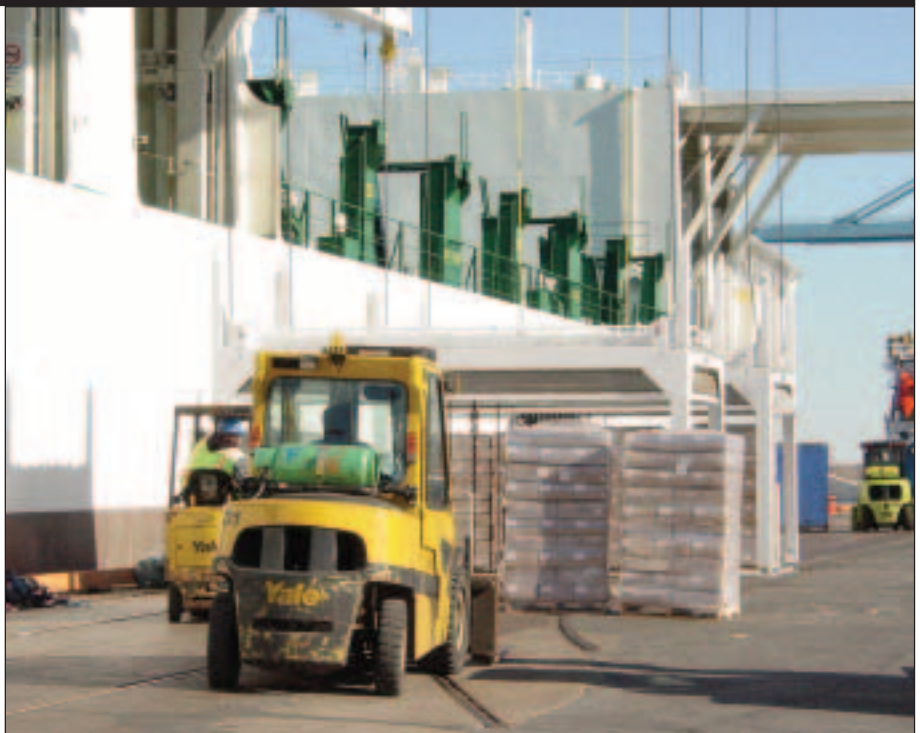
During its maiden voyage to the Port of Wilmington, the M/V Luzon Strait discharged nearly 3,000 pallets or approximately 6,000 tons of Australian frozen beef for distribution to U.S. and Canadian markets.

Cold Chain Distribution Services, the refrigerated warehouse division of the Port of Wilmington, orchestrates the discharge, storage, inspection and distribution of the Australian beef imports. By providing all of these services, the Port of Wilmington is a leading destination for frozen and refrigerated cargoes – especially frozen beef.