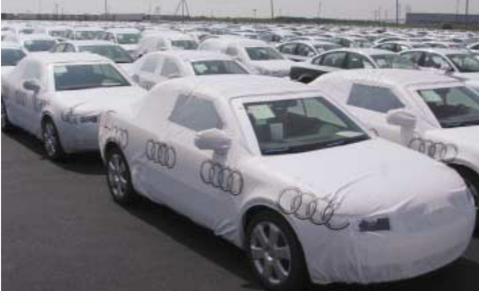
The Port of Wilmington recently paved an additional 1.46-acre lot which is leased to Volkswagen of America for storage of their Volkswagens and Audis imports.

New Volkswagens and Audis are parked on a recently-paved lot at the Port of Wilmington. The Diamond State Port Corp. (DSPC) recently developed the 1.46-acre lot to increase storage capacity for Volkswagen of America, Inc. (VWoA) as part of a five-year lease signed with the Port in 2003.