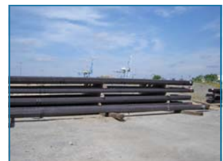
TMK pipe cargo stored at the Port of Wilmington, Delaware