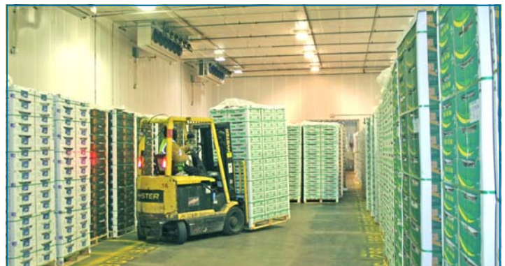
Port 2009 seasonal Brazilian grape volume projections indicate a significant increase over the 2008 program

CT is a strict US Dept. of Agriculture (USDA) requirement for Brazilian grapes to be allowed into the country. The process is performed in accordance with USDA guidelines and consists of segregating the fruit for a period of 15 days while holding it at a constant