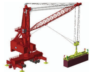
Caption: The Port will purchase a new mobile harbor crane by the beginning of the new year to handle containers, break-bulk and bulk cargos.

Since the Port's acquisition by the State in 1995 and through FY 2010, the State has provided the Port with over $162m to fund various capital projects, and, in turn, the Port has been a capable steward of these investments and has returned over $340m in tax revenue to the state's coffers.