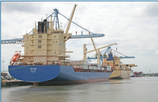
M/V Helene and M/V Iridium, Great White Fleet's newly chartered vessels will increase Chiquita's weekly distribution capacity for the Central America—Wilmington, DE lane by 22%.

Chiquita Fresh North America (Chiquita) , the Diamond State Port Corporation (DSPC), and port community welcomed the arrival of m/v Helene and m/v Iridium to the Port of Wilmington, Delaware in August. Great White Fleet, Chiquita's shipping line, chartered the reefer-capable container ships for its weekly service between Central American ports and Wilmington replacing the Eurys class ships previously employed in this service. These two ships will boost Chiquita's reefer cargo carrying capacity by 22 percent on this route.