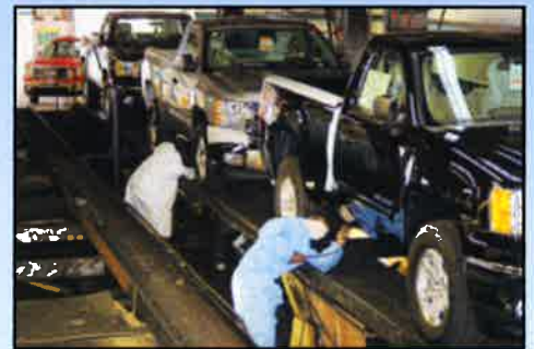
ISO 9001 certified vehicle processor