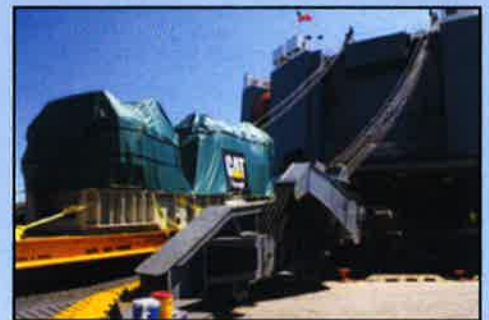
4 decades of experience handling commercial, military, fleet, RoRo and high & heavy cargo