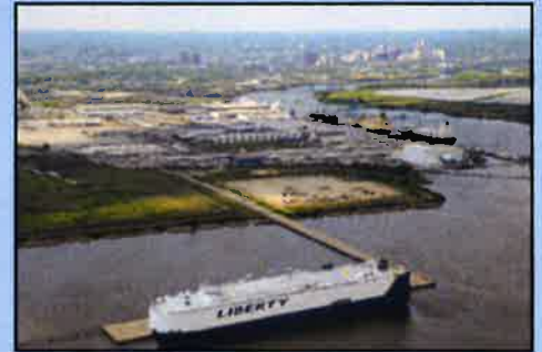
Dedicated PCTC-capable Auto/RoRo berth on the Delaware River provides direct access to vehicle storage areas